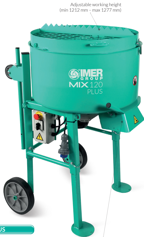
Adjustable working height (min 1212 mm - max 1277 mm)